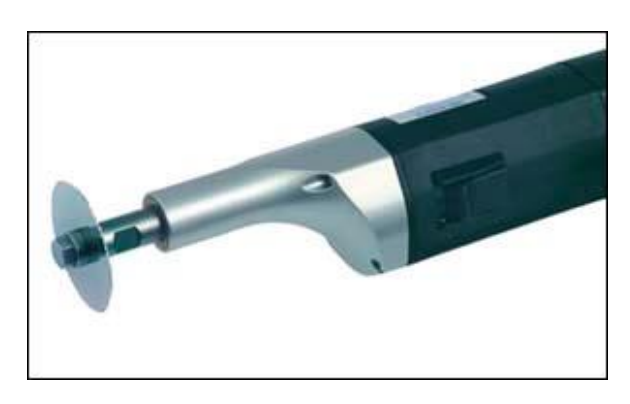
MST-Instrumente GmbH - manufacturer of plaster saws, autopsy saws and horse dental rasps

The Risk Manager has been used in the company since 2005 to prepare the risk management files. Since it was known that the solution had extension modules, for example for medical electrical devices, the brothers decided to evaluate the full version of Risk Manager first. Thus, all relevant requirements and standards were to be covered in one system in a clear and time-saving way. During the test phase, the company's employees were